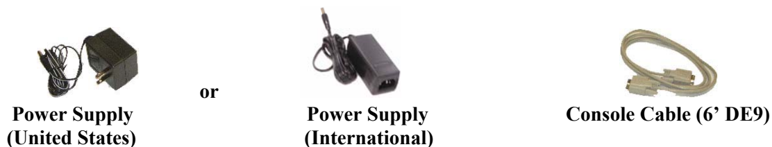
Figure A Package Contents