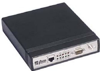
C200 and C250 Series

JBM Electronics has been supplying communications devices since 1980. Our units have helped many large networks adapt to changing requirements with advanced, cost-effective solutions. The wireless Gateways are the newest product, which build on our library of protocols and management tools.